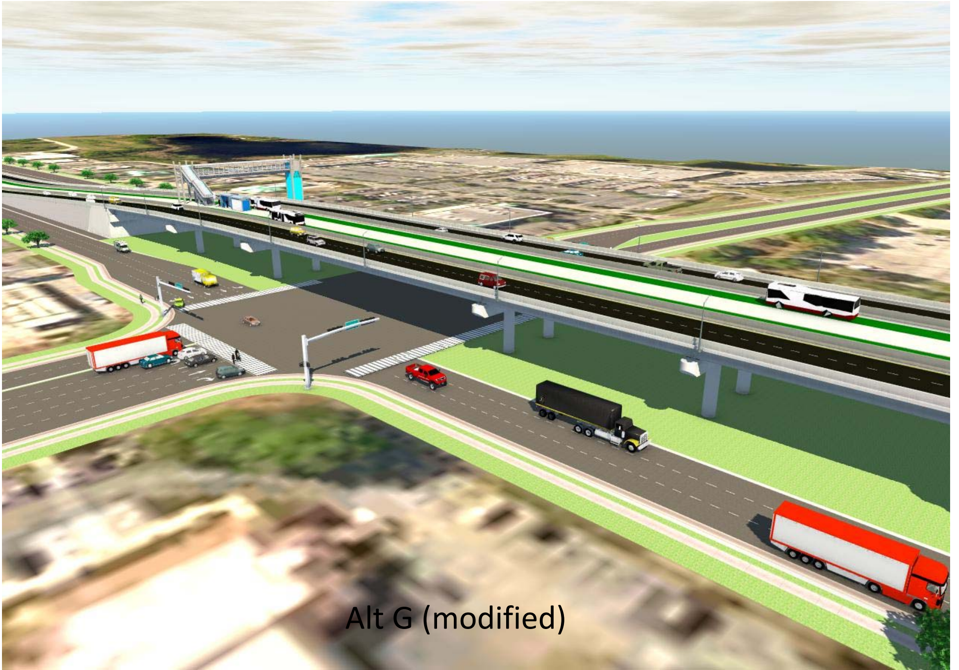
Alt G (modified)