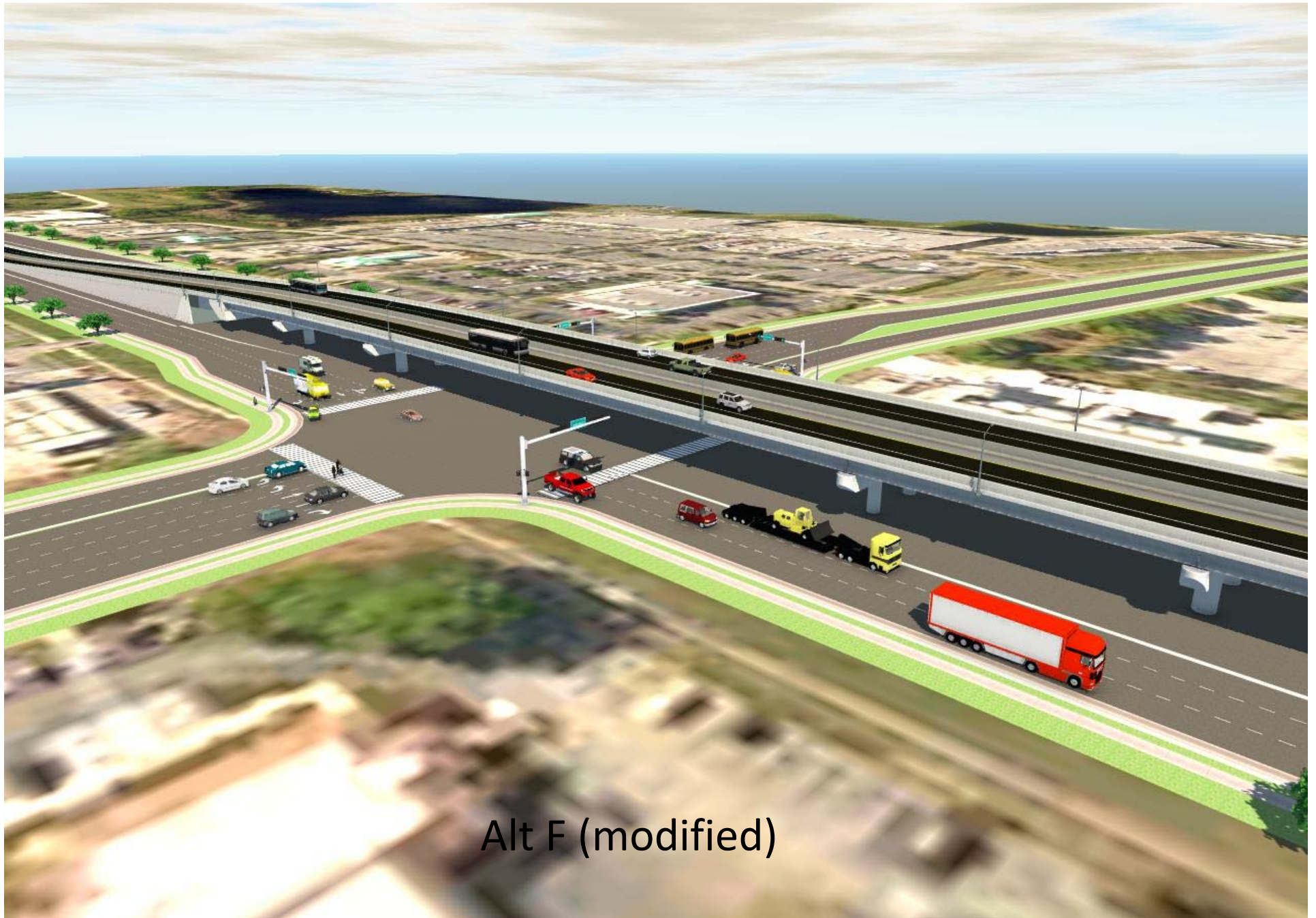
Alt F (modified)